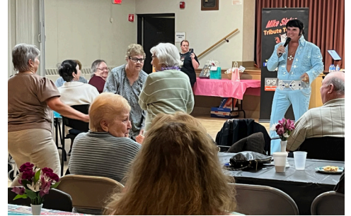
Elvis Night - September