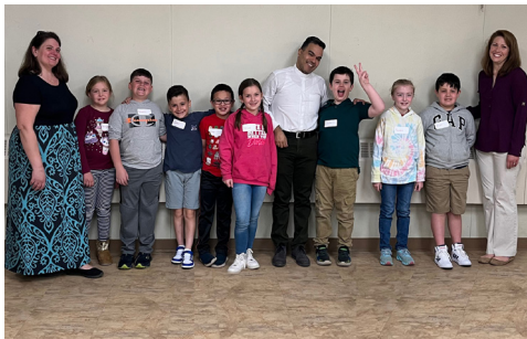
2nd Grade Retreat