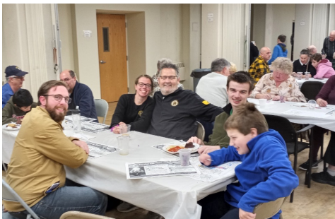
Free Pasta Dinner for Parishioners