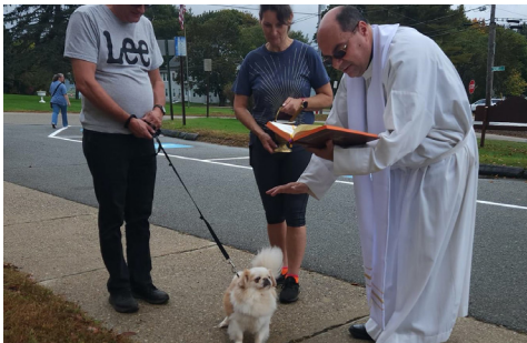
Blessing of Pets - October