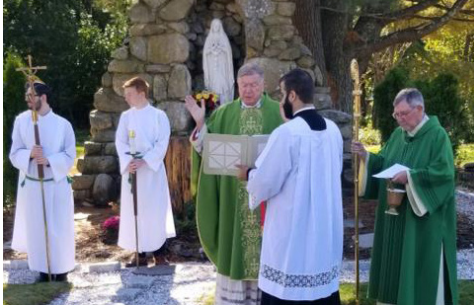
Bishop Blessing our Mary Grotto