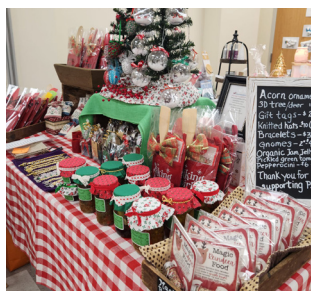
Holiday Fair - Dec. 2nd