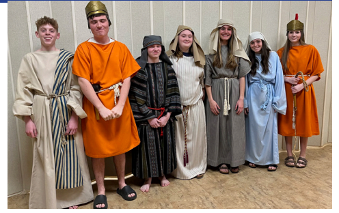
Living Stations of the Cross