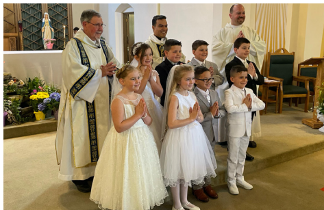
1st Communion - May 7th