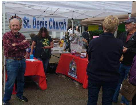
St. Denis' Booth at Oktoberfest