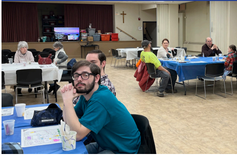
Lenten Fish Dinners