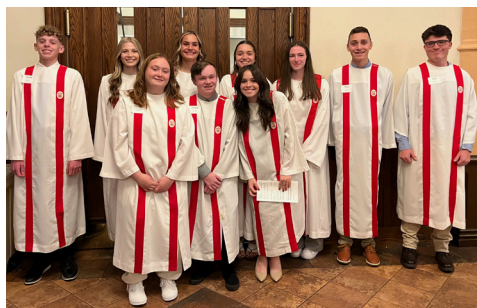
Confirmation - Nov. 19th