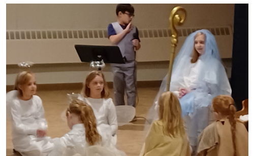
2nd & 3rd Grade Living Nativity

Online Giving Make one time or recurring payments, donate to the food pantry and support other ministries and fundraisers. Make your regular Offertory donation, especially if you will be away! Use the QR code , text the word give to 508-850-0128 , or visit SaintDenisChurch.com/offertory-regular