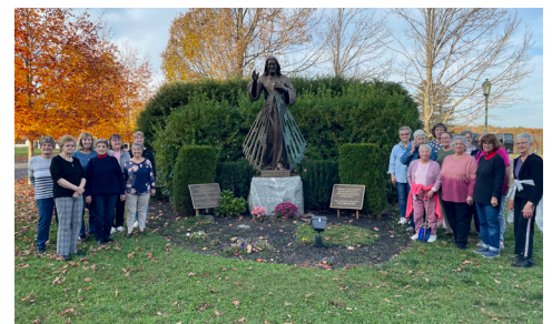
Trip to National Shrine of Divine Mercy