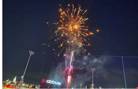
St. Denis @ the WooSox - August