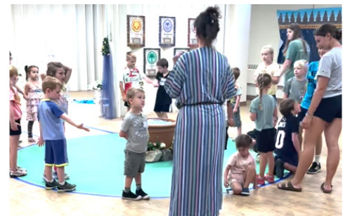
Summer Vacation Bible School