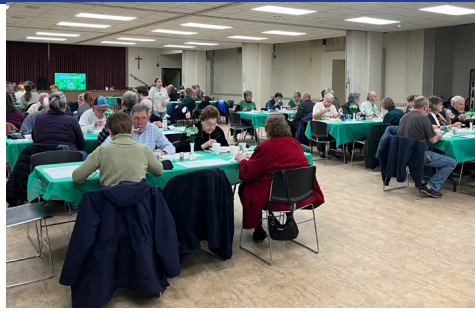
St. Patrick's Day Dinner