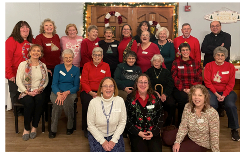
CWC Christmas Party